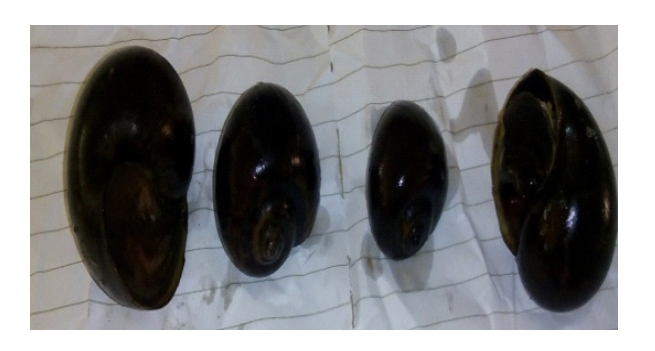
Plate 1: Lanistes libyscus