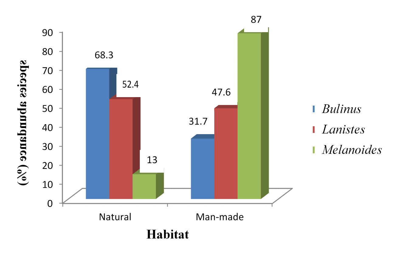
Figure 2: Variation in snail species abundance in Natural and man-made habitat

Bulinus globossus (B.gl); Bulinus forskalii (B.fo); Bulinus truncatus (B.tr); Lanistes libyscus (L.li); Melanoides tuberculata (M.tu)